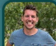
Senior Data Scientist