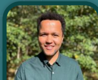
Senior Data Engineer