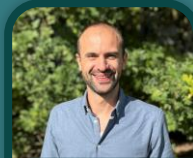
Senior Data Analyst